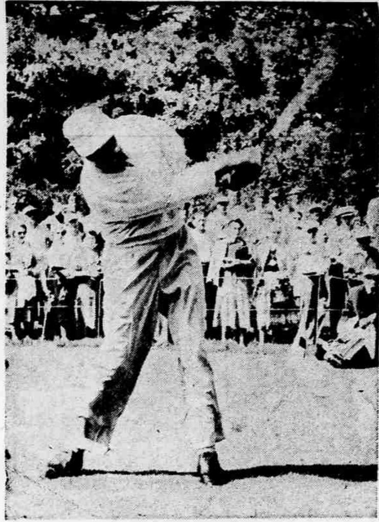
TAKES ALL COMERS —National Open golf champ Ed Furgol tees off at first hole of rugged Olympic Club Lake Course at San Francisco in battle against all comers during National Golf Day festivities. Furgol actually was giving the acid test to the toughened Olympic Club course, scene of the forthcoming U. S. Golf Association Open.