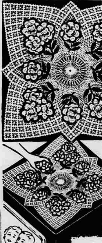
7265 by Alice Brooks

Crochet roses in glowing color — they stand up in lifelike form on this most beautiful TV cover!