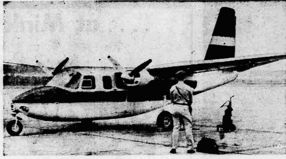
LONE SENTRY GUARDS new four-seat, two-engine, blue and white plane which is being used to transport President Eisenhower to his nearby Gettysburg, Pa., farm. Small craft can make 80-mile trip in 30 minutes and land on 2,200 foot grass landing strip at Gettysburg.

A world stamp fair will be held at Oslo June 4-12 in connection with Norway's postal centenary.