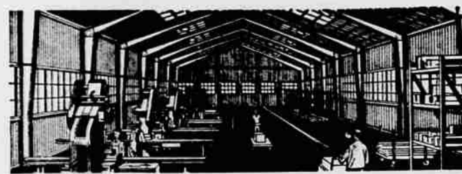
More Production Area Per Dollar! Efficient production layout is easy with clear-span Soulé Buildings. Every square foot of floor area is usable!

SIZES TO FIT ANY NEED Widths: 32, 40, 50, 60, 70, 80', Lengths: Multiples of 20', Eave Heights: 10, 12, 14, 16, 18, 20'