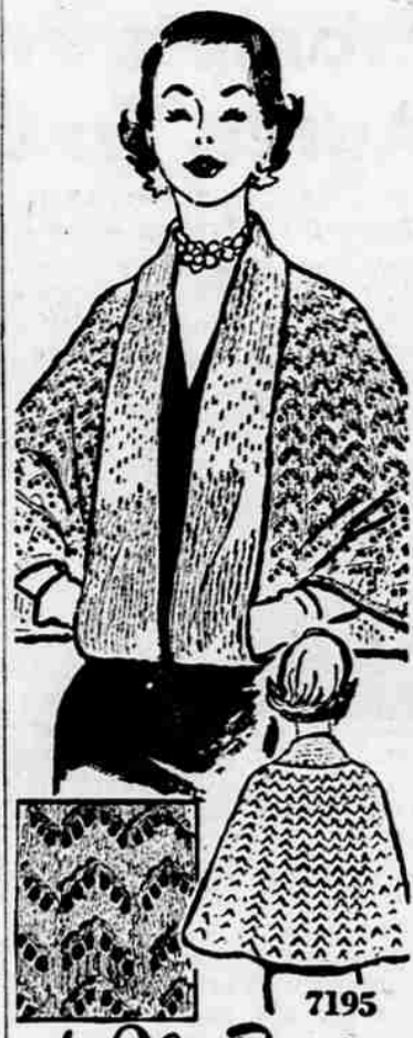
7195 by Alice Brooks

JIFFY-KNIT Clutch-cape is the most flattering for a woman's figure!!! In a pretty lace pattern—perfect for all occasions.