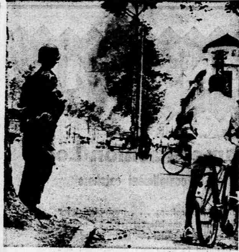
BATTLE BOULEVARD — A Viet-Nameese soldier and a civilian on bicycle look up flaming Boulevard Gallieni in Saigon during street fighting between Nationalist Army and rebel forces. Troops of pro-American Premier Ngo Dinh Diem's government drove the last rebel troops out of Cholon in another major victory that gave the anti-Communist premier a firmer grip on divided Viet-Nam.