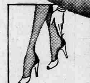
WILL NOT SAG AT ANKLES

Only 1 15 PAIR In 3 sizes that fit every leg perfectly