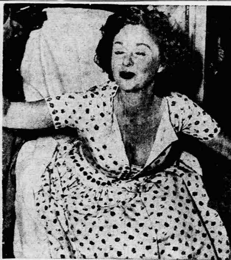
FEELING FIT —"Mmmm, fresh air," says Actress Susan Hayward as she rises from wheelchair on leaving Cedars of Lebanon Hospital in Hollywood. She had been confined for treatment for an apparent overdose of sleeping pills.

Permanent x-ray centers for use of the people of the county are provided by the Jackson County Public Health association at Community hospital on Wednesday from 3 p.m. to 6 p.m. and at Sacred Heart hospital on Thursdays from 2 p.m. to 5 p.m.