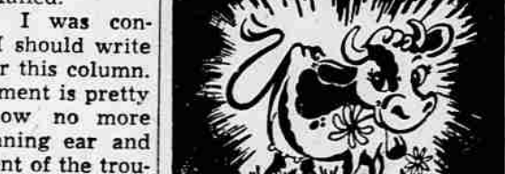
MOO-O-OS AND MUSINGS

considering whether I should write a piece about it for this column. After all, the treatment is pretty simple and I know no more about chronic running ear and the proper treatment of the trouble than any doctor knows.