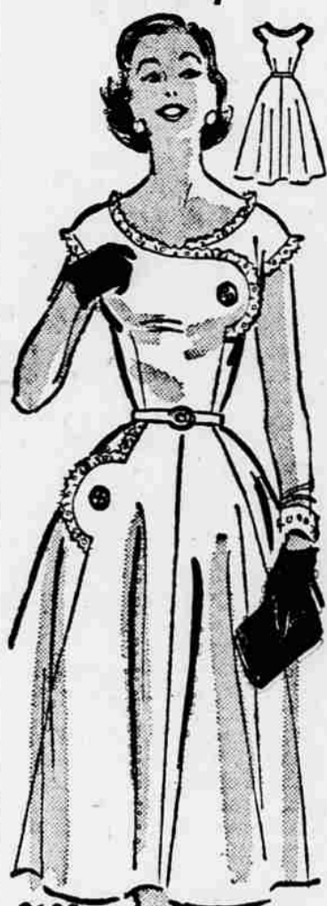
9100 by Marjorie Martin

Note the sweet scoop of neckline—scalloped bodice and pocket detail. Lovely outlined with lace trim! The style—graceful, simple, surely flattering to almost every figure! Perfect for summer in pretty cotton, pique fabrics; in shantung too, for dressier wear.