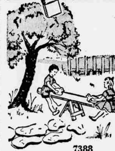
7388 by Alice Brooks

It's so EASY to build this sturdy wooden seesaw; a child's dream to come true! Save many dollars by "doing it yourself!" Woodcraft Pattern 7388: Directions for building seesaw. Actual size paper pattern pieces included, with easy-to-follow number guide.