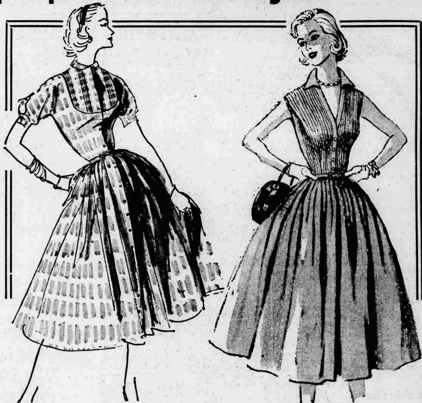
L'AIGLON COAT DRESS