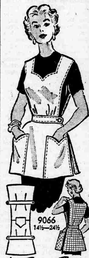
by Marian Martin

Half-Sizers! Three wonderful ways you can wear this style! An apron at clean-up time—a smart sports jerkin—a terrycloth beachcoat for summer fun. Easy sewing—it's perfectly proportioned for the shorter, fuller figure. Opens flat for jilly ironing.