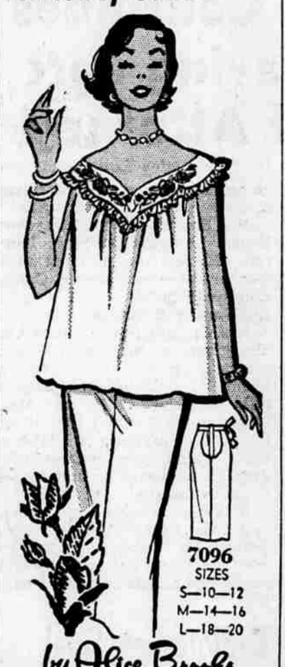
by Alice Brooks

Only TWO main parts to this easy-sew top! Adjustable open front on the skirt assures perfect fit throughout the waiting period!