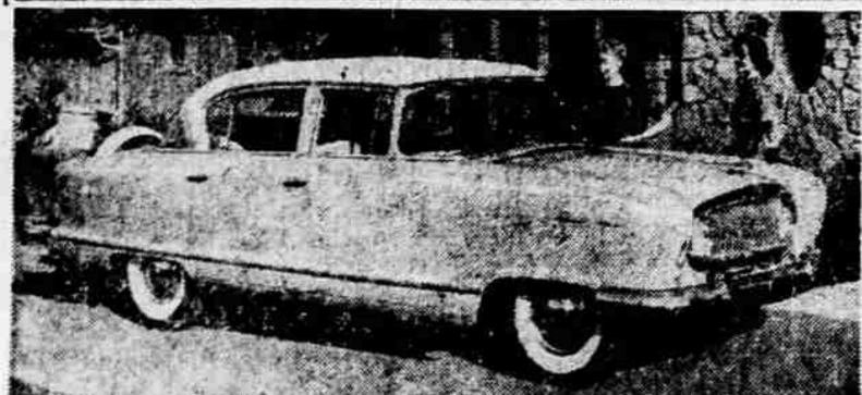
NEW 1955 NASH — Pictured above is the 1955 Nash Ambassador hardtop, with "Scenaramic" wrap-around windshield, die-cast grill with inboard headlights and forward-thrusting fenders. Below, Nash Ambassador four-door sedan available with new 208 horsepower Jetfire V-8 engine.