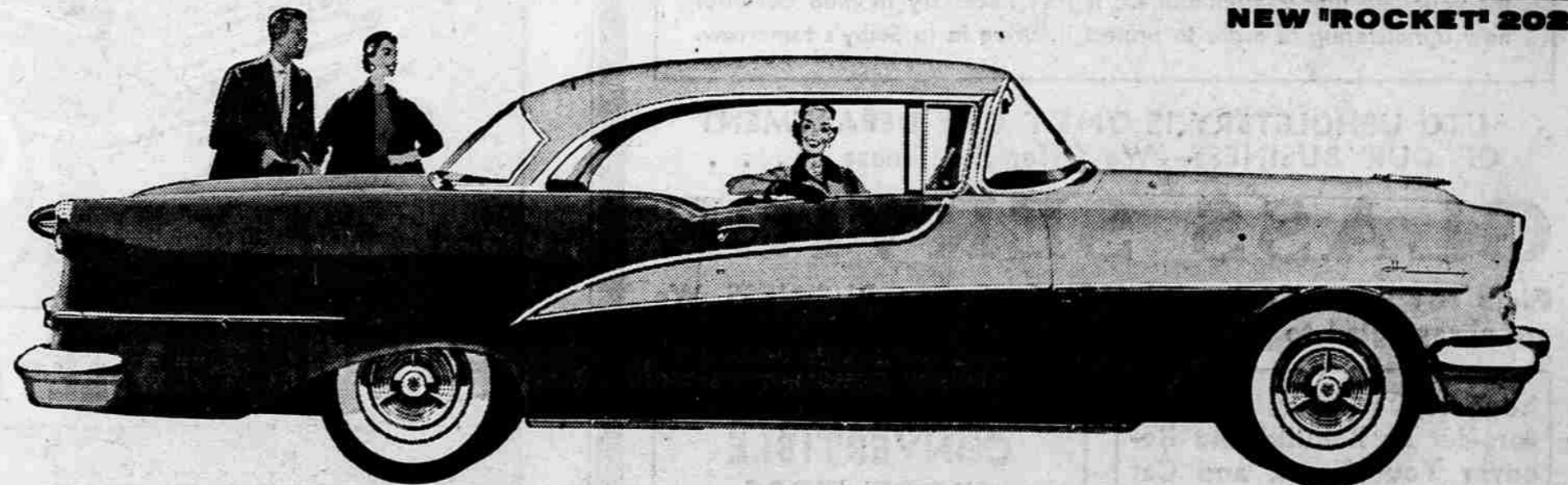
1955 Oldsmobile Ninety-Eight Deluxe Holiday Coupé. A General Motors Value.

Also on Special Display at YOUR OLDSMOBILE DEALER