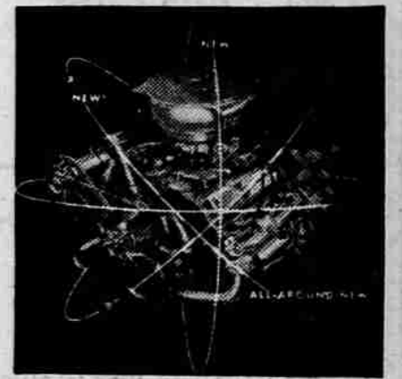
NEW "ROCKET" 202

In power and performance, too, Oldsmobile steps far ahead—with the greatest "Rocket" Engine on record! It's Oldsmobile's new "Rocket" 202 . . . now delivering 202 horsepower with an ultra-high, 8.5-to-1 compression ratio! Don't miss the Show . . . and don't miss the big stars . . . Oldsmobile's "Rocket" Engine cars for 1955!