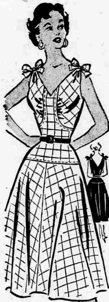
9030 12-20 by Marian Martin

Here's a simple sundress — with a world of style! Lovely long torso effect atop the whirly flattering for YOU! Fitted bodice with cool V-neckline, perky shoulder ties. Perfect in colorful check cotton; shantung or dressier affairs!