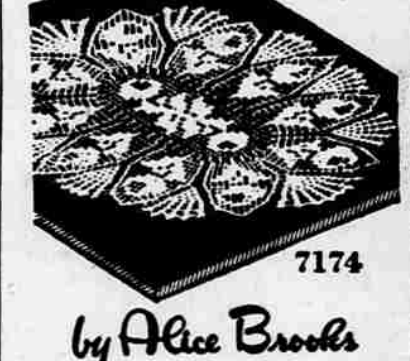
by Alice Brooks

Make this lovely oval doily or centerpiece for your home. Smart combination of filet crochet and regular crochet — fast, easy to do!