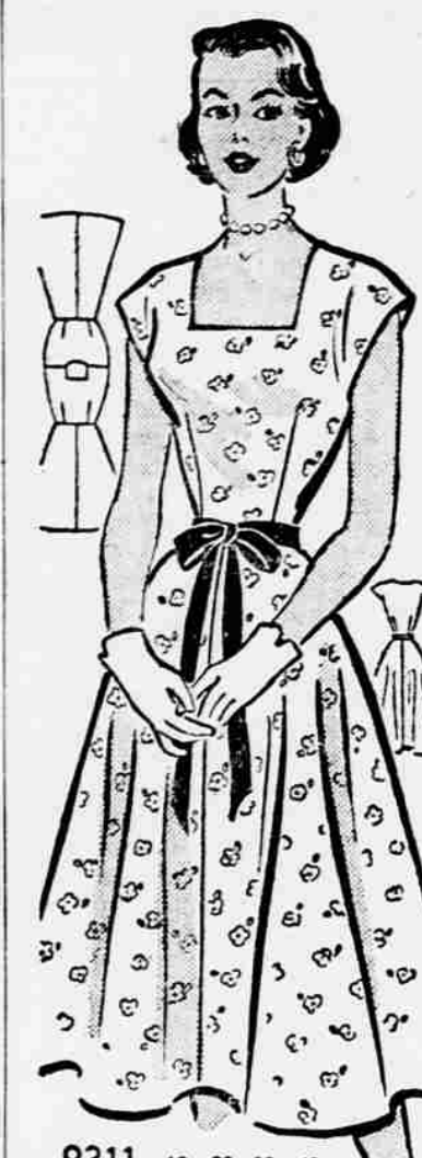
9311 12-20; 30-42 by Marian Martin

SEE this honey of a dress! Then study the diagram! Did you ever see such an easy sew? FEW pattern parts, minimum details. Get this on your sewing machine right now! Make it up in crisp cotton, print silk or shantung!