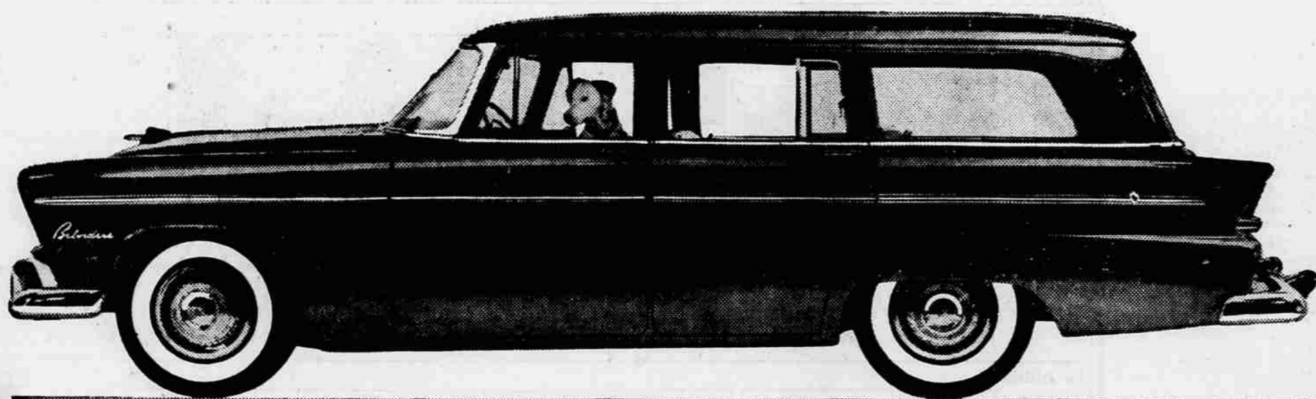
Actual photo of the Plymouth Belvedere 4-door Suburban