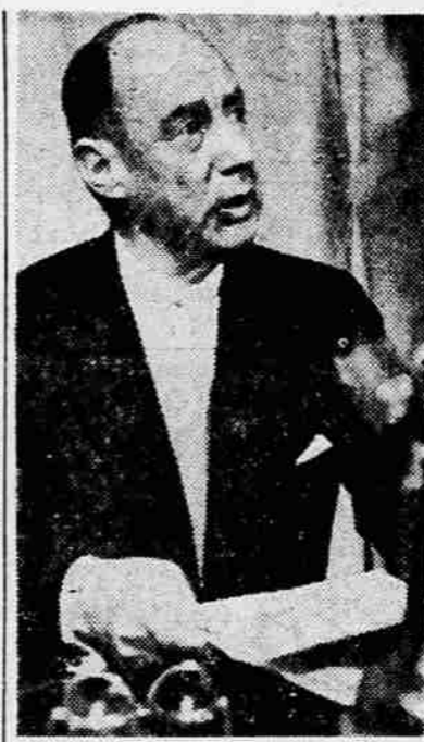
AGAINST WAR RISK —Adlai E. Stevenson, former Democratic presidential candidate, speaks out in radio address from Chicago against risks of a third war in defense of Chinese Nationalist islands of Quemoy and Matsu. He warned the U. S. to shun lonely stand of the islands in favor of a united free world defense of Formosa.