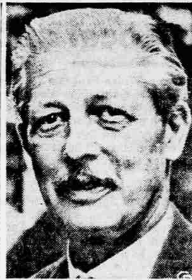
MENTIONED as possible choice for foreign minister succeeding Sir Anthony Eden, Britain's new prime minister is Harold MacMillan (above), present defense minister.

Samuel Brannan announced the discovery of gold at Coloma in San Francisco on March 15, 1848.