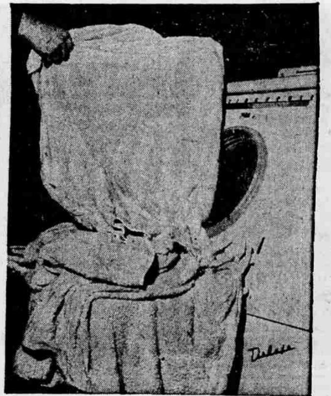
Photo above shows towels being removed from the Westinghouse Laundromat. There was no trace of sand on the towels or in the Laundromat tub.