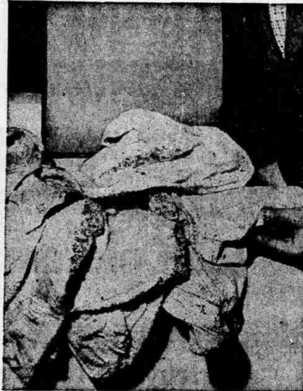
When towels were removed from this agitator washer, large deposits of sand were found in the folds of the towels, as show in above picture.