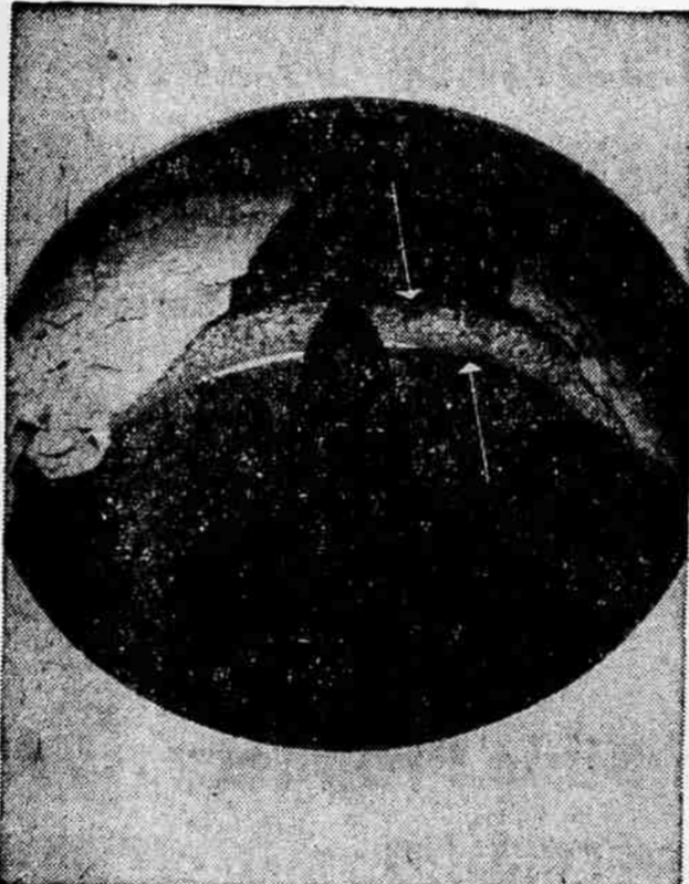
The photo above shows that almost half a cup of sand remains in the bottom of this agitator washer tub, the remaining sand being embedded in the towels.