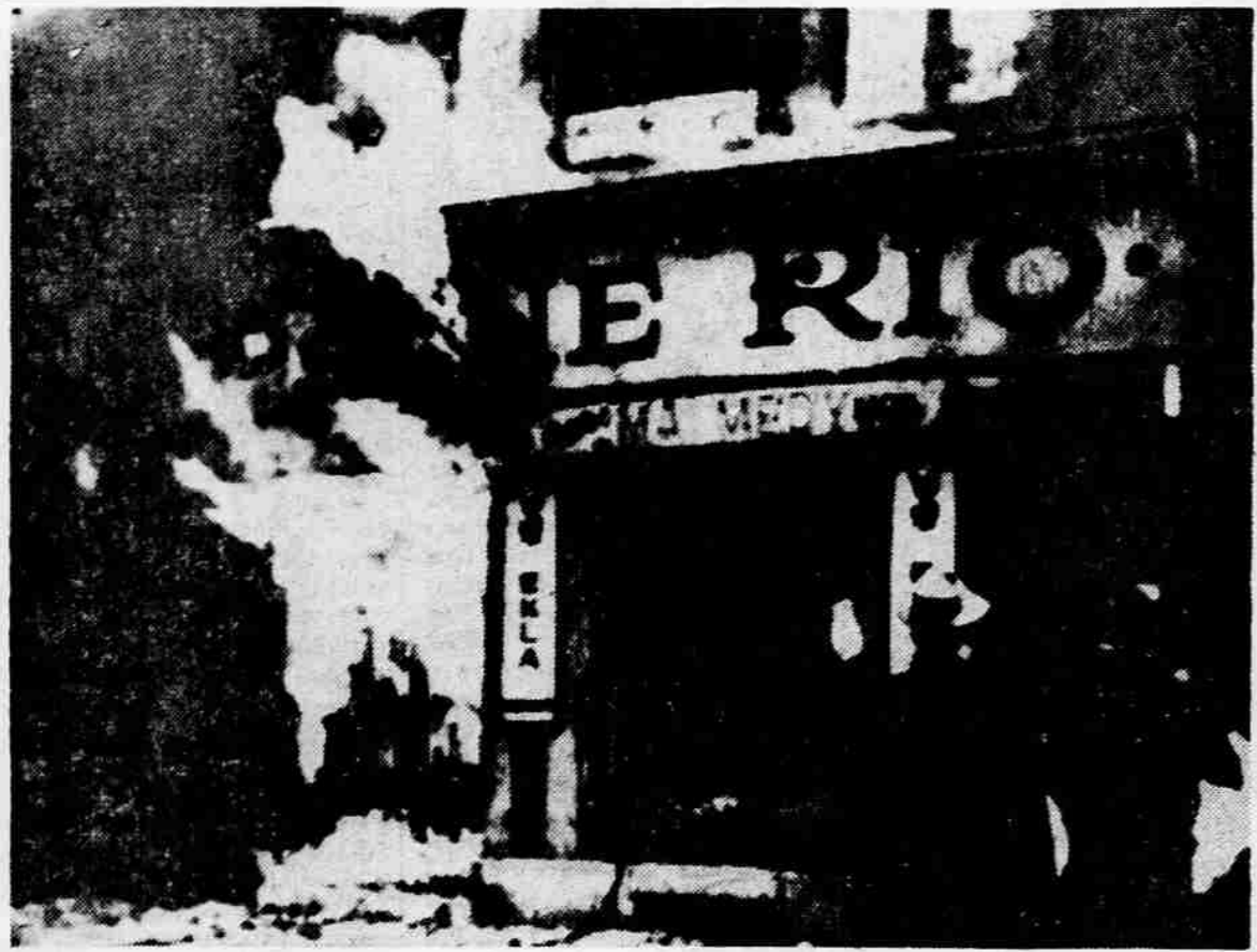
FATAL FIRE —Entrance to the Cine Rio movie house in Liege, Belgium, blazes after an oil heater exploded during a matinee performance. At least 39 persons, 22 of them children, were killed and 100 others injured. Many of victims were trampled to death in panic that resulted after quick-moving flames cut off one of the three exits of the crowded theater.