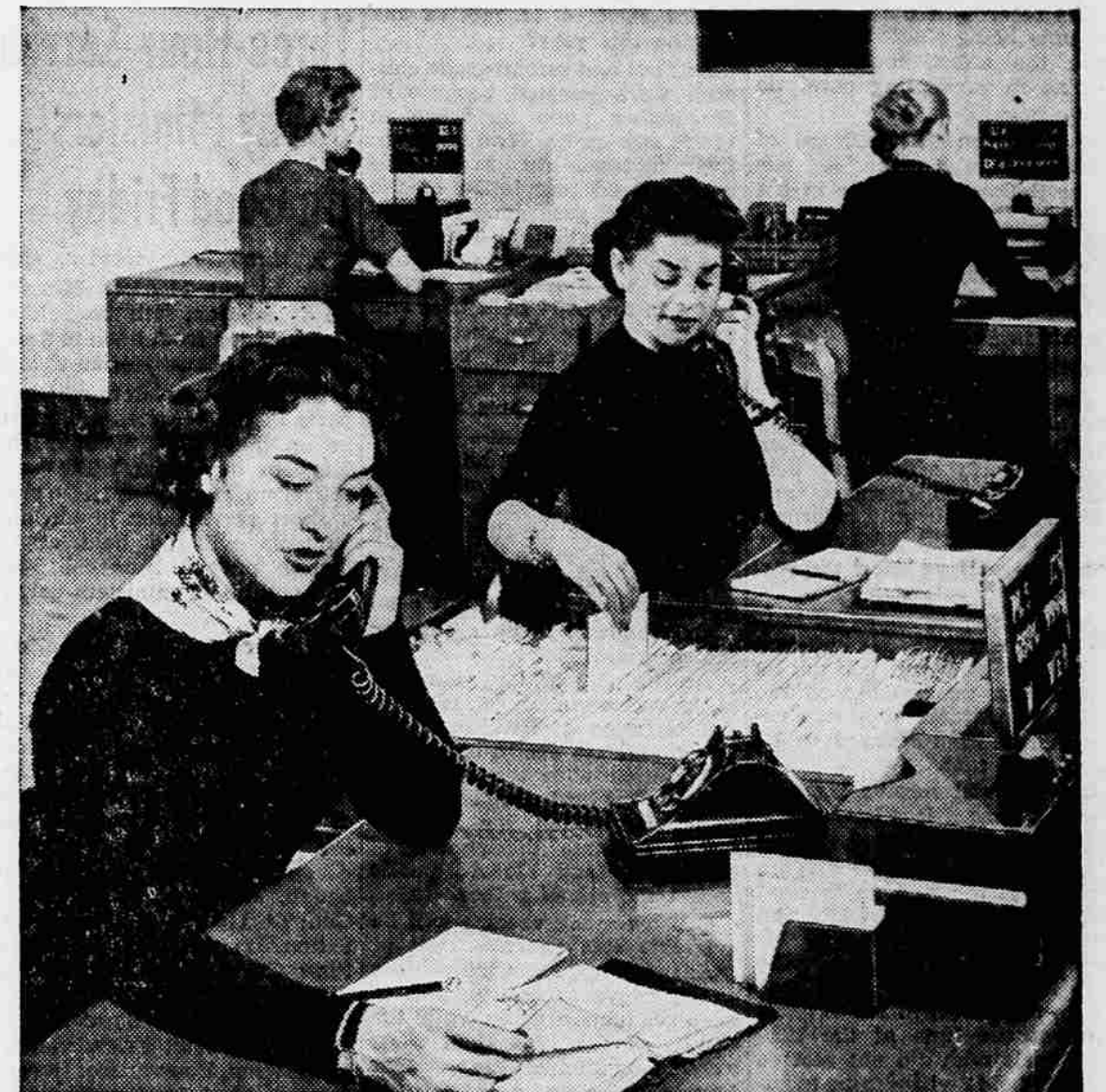
Special desk puts your name at their finger tips. Ever wonder how your telephone business office manages to answer your questions about your service so fast? Here's one of the reasons: This special "tub" desk, shared by two service representatives, keeps your telephone records within easy reach at all times. And if your "rep" is talking to another customer when you call, her "partner" is in a position to help you just as quickly. Tailor-made equipment like this helps us bring you fast, reliable, low-cost telephone service. Pacific Telephone works to make your telephone a bigger value every day.

Dead line Sunday Classified is at noon Saturday; 1 a.m. Monday for Monday; other days 3:30 previous day.