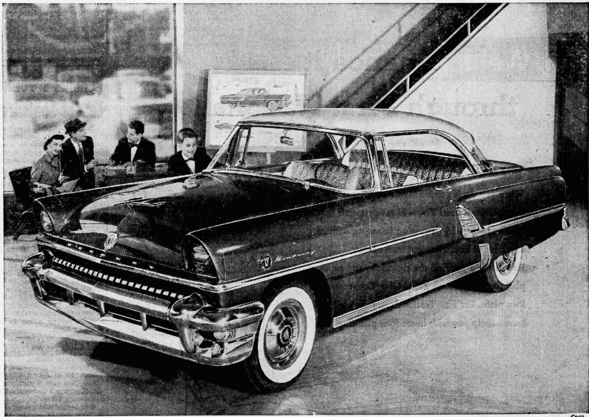
OUR SHOWROOM IS ONLY THE FIRST PLACE WHERE YOU SAVE. Mercury saves you money the day you buy, every mile you drive, and when you trade again. Shown above, the 188-hp Monterey hardtop Coupe.