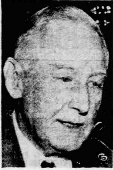
DENYING charges auto industry lacks competition, Harlow H. Curtice, General Motors president, tells Senators fight for new business has never been so aggressive.