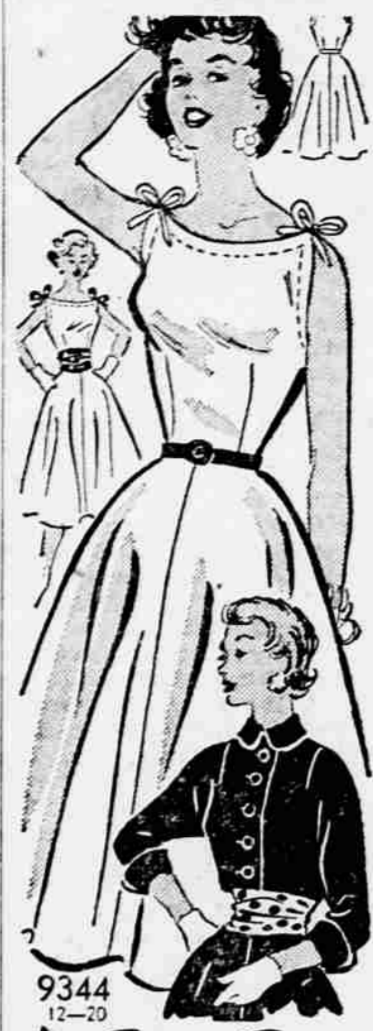
9344 12-20 by Marian Martin

TRIO of wonderful new fashions! You'll wear the cool sundress with or without its colorful cummerbund sash; add the shortie jacket for a smart sophisticated ensemble for late spring and summer. Sew it now!