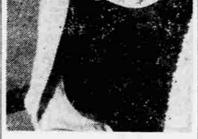
GROWING UP —Actress Margaret O'Brien, now 18, appears in Santa Monica court for approval on four contracts that will keep her busy in movies and TV. Under California she may not negotiate her own contract until she is 21. She expects to graduate from high school this June.

"We are deeply grateful for the fine cooperation we have received from the medical profession and the hospitals in mak-