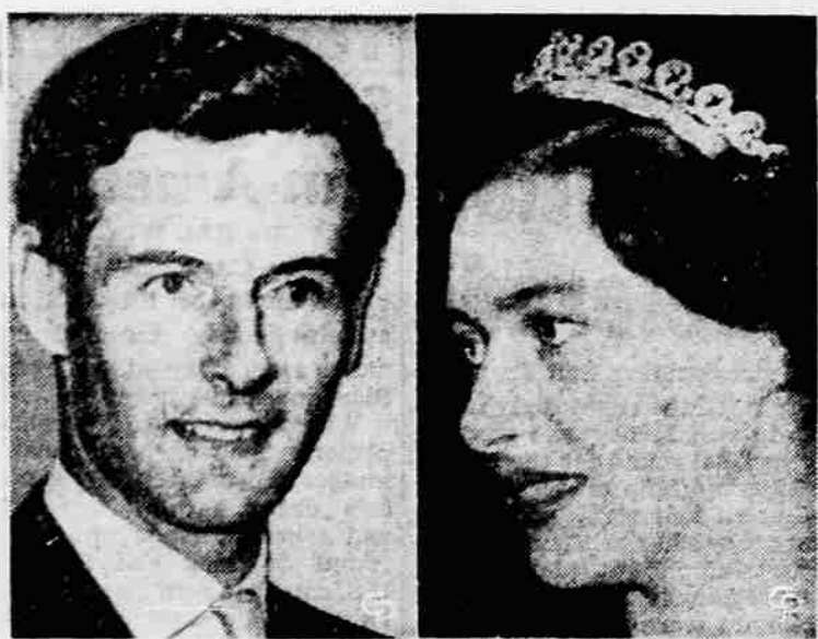
BRITISH PUBLIC OPINION appears to favor marriage of Princess Margaret to Capt. Peter Townsend, divorced commoner, judging by letters to newspaper editors. Indications are rites may occur on Margaret's 25th birthday this year.