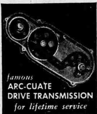
famous ARC-CUATE DRIVE TRANSMISSION for lifetime service