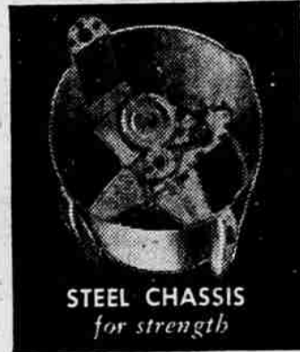
STEEL CHASSIS for strength