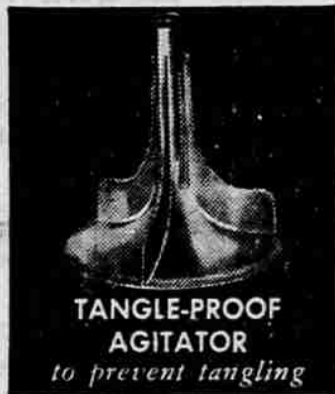
TANGLE-PROOF AGITATOR to prevent tangling

LADIES! SATURDAY ONLY-AT OUR BARGAIN STORE!