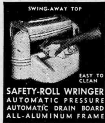
SAFETY-ROLL WRINGER EASY TO CLEAN AUTOMATIC PRESSURE AUTOMATIC DRAIN BOARD ALL-ALUMINUM FRAME