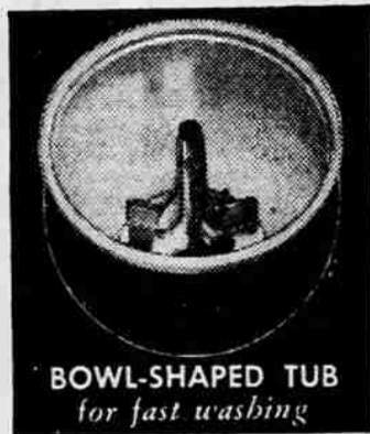
BOWL-SHAPED TUB for fast washing