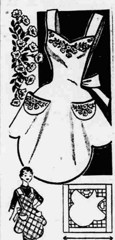
7316 by Alice Brooks

Easy-sew apron takes ONE yard 35-inch! No embroidery! Iron-on red petunias with green leaves. Make for yourself and for gifts!