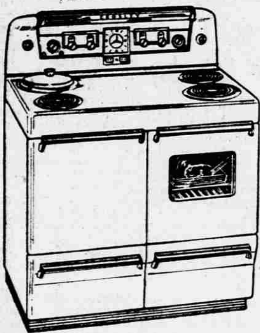
MODEL No. CTG-40