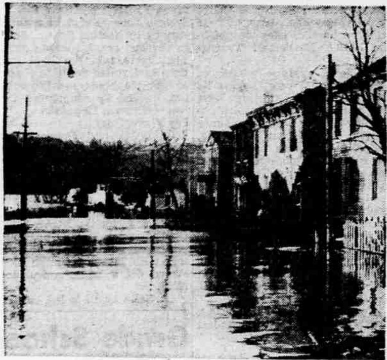
HARDEST HIT —The flooding Ohio River which already has left 1355 persons homeless in Hamilton County, Cincinnati, is expected to crest at 61 feet. Above photo shows flooded homes in eastern section of city, one of hardest hit areas as water rose above 57 feet.

The cars were declared surplus after some of the cable car lines were shortened in a recent reorganization.