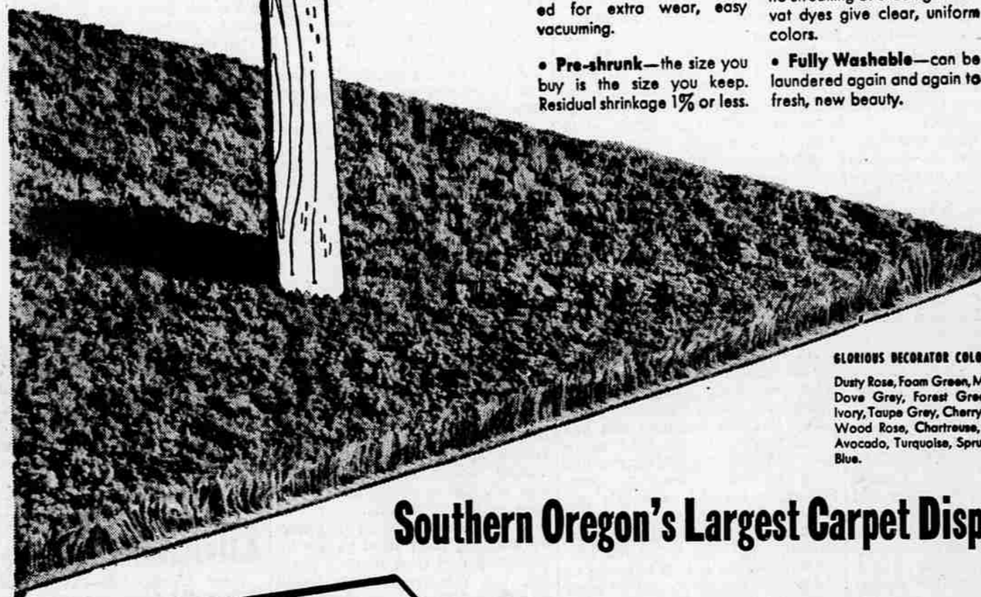
GLORIOUS DECORATOR COLORS!

Dusty Rose, Foam Green, Muted Beige, Dove Grey, Forest Green, Ancient Ivory, Taupe Grey, Cherry Red, Gold, Wood Rose, Chartruse, Cinnamon, Avocado, Turquoise, Spruce, Powder Blue.