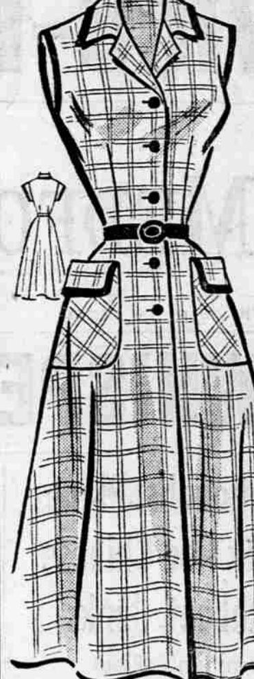
9051 12-20; 30-42 by Marian Martin

You've asked us again and again for your favorite "good classic." Here it is! Depend on it to go everywhere at the ring of the phone, to keep you neat and smart wherever you go this spring and summer.