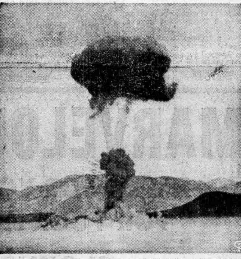
NUCLEAR CLOUD forms from fireball while steam is sucked up toward cloud in first explosion of "Operation Teapot," atomic device tests conducted at Yucca Flat, near Las Vegas, Nev. The device used in first blast was dropped from plane.