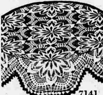
7141 by Alice Brooks

Lovely decoration for tables, chairs, buffets! Easy-crochet this smart hexagon-shape design!