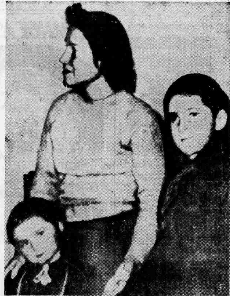
GRANTING EXCLUSIVE interview to William Randolph Hearst, Jr. and aide, Svetlana Stalin, only daughter of late Soviet dictator is photographed with her son and daughter in a modest Moscow apartment.

This line lost all its cars in the fire and earthquake of 1906. It had to be rebuilt following the disaster, and the offering of surplus cars are these post-1906 models.