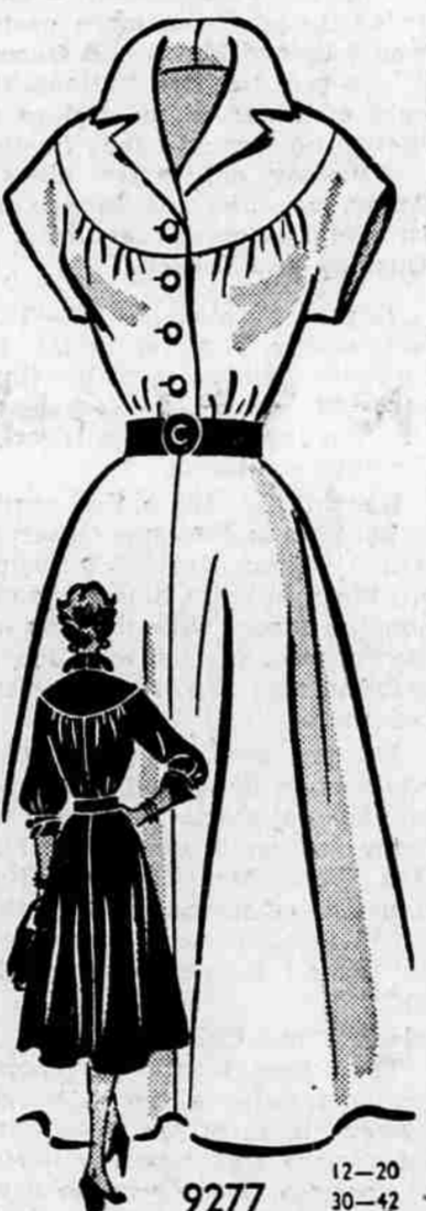
9277 12-20 30-42 by Marian Martin

This is it! The pattern you, our readers, have chosen for your spring favorite! So flattering to the figure, we cut it in sizes from 12 to 42! So casual, you can wear it round the day! So smart too; you'll love its dashing lines, graceful yoke detail.