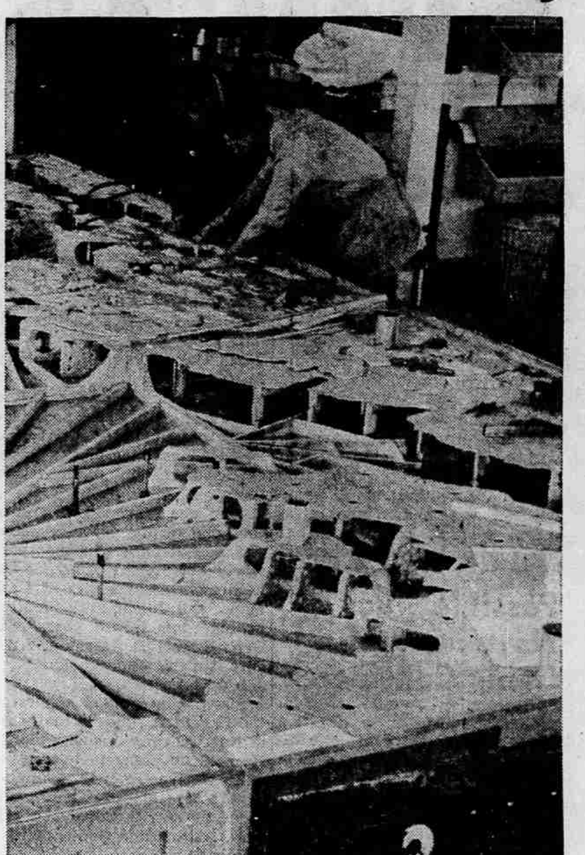
COMPLEX WORK — Shown is a section of the complex work required to build a miniature working model of a huge hydroelectric project. Internal construction on the Quoddy model project required plumbing and tanks to provide a change of ocean tide cycle; electrical circuits to operate the many lights, and accurately-sawed plywood buildups, representing elevation changes. H. Noel Poirier, now a Rogue valley resident, is shown on the right with an assistant during construction of the model in 1939.