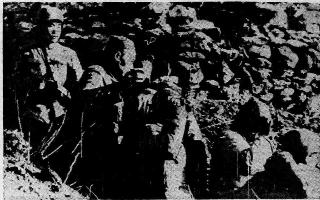
IT'S OVER FOR THEM —Captured Chinese Nationalist soldiers walk from a bunker on Yikiang Island during last month's attack by Communist troops, according to caption supplied with this official Red Chinese photo from Peiping and released in London. Yikiang is eight miles north of the Tachens. Nationalist bombers claimed they caught a Red convoy near Yikiang Feb. 2 and "hit and exploded" two large Red vessels. Three waves of Nationalist bombers pounded the island with excellent results Feb. 3 according to official Nationalist claims.