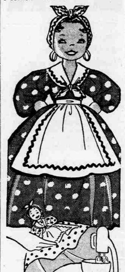
7199 by Alice Brooks

Let this gay doll keep your electric mixer spotless! Just slip her on top of it—her long, full skirt is its protective cover! Use colorful remnants. Bazaar Gift. Pattern 7199: Pattern pieces, transfers, directions for making mixer-cover doll. Easy! Such fun! Send TWENTY-FIVE CENTS in coins for this pattern—add 5 cents for each pattern for 1st-class mailing. Send to Medford Mail Tribune, Household Arts Dept., P.O. Box 168, Old Chelsea Station, New York 11, N. Y. Print plainly NAME, ADDRESS AND PATTERN NUMBER. WONDERFUL is the word—for our NEW Alice Brooks Needlecraft Catalog for 1955. Exciting, enchanting—our new designs are all that—and even more! Send 25 cents for your copy of this terrific catalog—NOW! You'll want to order every wonderful design in it!