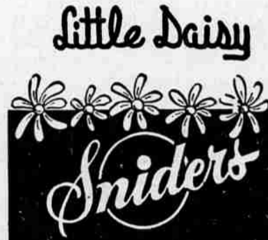
Little Dairy Sniders

He's almost a cinch to be introduced from the audience by Ed Sullivan on his next Sunday night show.