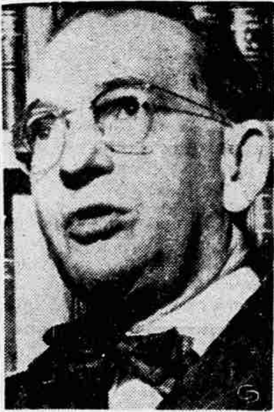
ANGERED over newspaper article on tax reduction, Edgar Faure (above), who became French Foreign Minister when Premier Pierre Mendes-France gave up post, challenges Jean-Jacques Servan-Schreiber, editor of weekly "Express" to duel. Editor accepted.

St. Louis—(U.P.)—Four duck hunters made good use of their duck blind in a recent cold snap. Marooned in nearby Alton Lake when their boat was sunk by high waves, they burned the blind piece-by-piece while awaiting rescue.