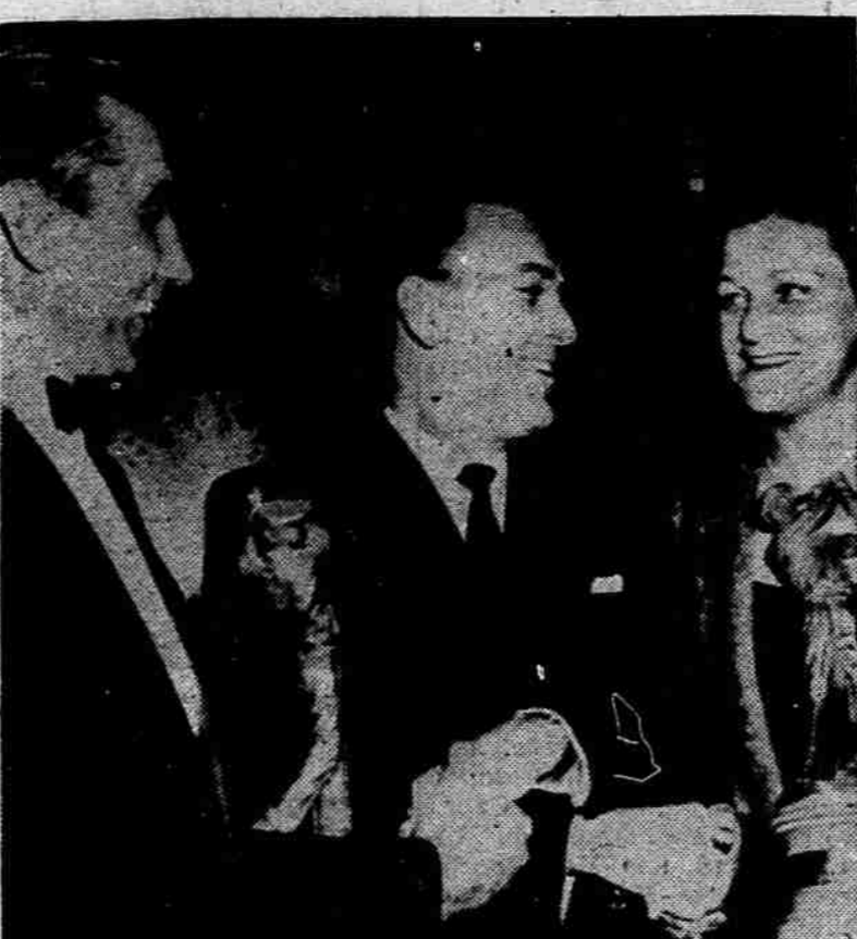
UP THE HARD WAY—Ben Hogan (center) congratulates two winners of the Ben Hogan Trophy as he presents them with the awards in New York. U. S. Open champion Ed Furgol (left) is the 1954 winner and Babe Didrikson Zaharias (right) was 1953 winner. Trophy is given annually to the golfer who has overcome physical handicaps to continue playing. Furgol's left arm was shattered in playground accident when he was a youth. It is 10 inches shorter than his right arm and is permanently crooked at the elbow. Mrs. Zaharias was stricken with cancer.