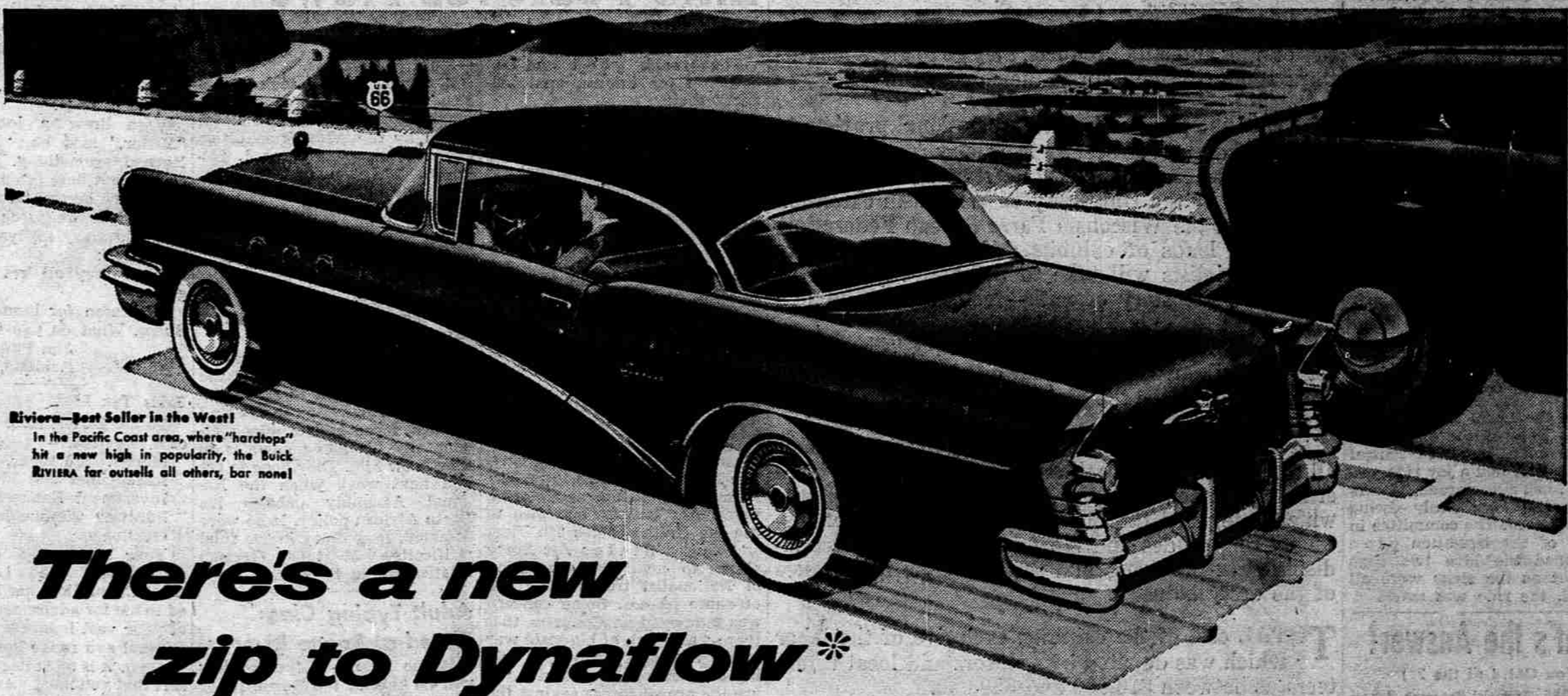
Buick—Best Seller in the West! In the Pacific Coast area, where "hardtops" hit a new high in popularity, the Buick Wildcat for outsells all others, bar none!