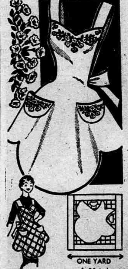
Pattern 7316: Tissue pattern, washable iron-on color transfer in combination of red and green. Medium size only.

Send TWENTY-FIVE cents in coins for this pattern — add 5 cents for each pattern for 1st class mailing. Send to Medford Mail Tribune, Household Arts Dept., P.O. Box 168, Old Chelsea Station, New York 11, N. Y. Print plainly NAME, ADDRESS and PATTERN NUMBER.