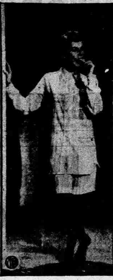
Bermuda shorts are popular for bedtime, too! This trim cotton pajama outfit combines Bermuda shorts with a man-tailored shirt. They are both made of soft Sanforized cotton flannelette in pastel stripes, the National Cotton Council says.