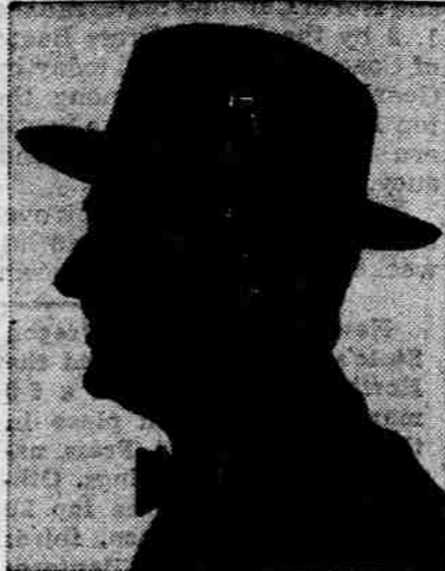
POLIO'S MYSTERY MAN He's a Resident President

Other clues follow: He was born in California in 1904 and became a Beaver in 1941. He came to the Rogue valley in 1946. He is a father. Some officials conceal evidence. Other officials disclose facts and reason. My first name is the same as one of the saints. There are two other men in Oregon holding positions identical to mine. I might be considered a Southern