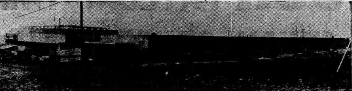
JUNIOR HIGH BUILDING — Shown above, under construction, is the new Medford junior high school building, located on East Jackson st., between Pearl st. and Keeneway. First classes will be held in the new building starting next fall. Junior high school students from Roosevelt and Lincoln schools, and from Districts 29 and 102 will attend classes in the new school, as will fifth and sixth grade students from Roosevelt school. The fifth and sixth graders will be housed in the building on a temporary basis.