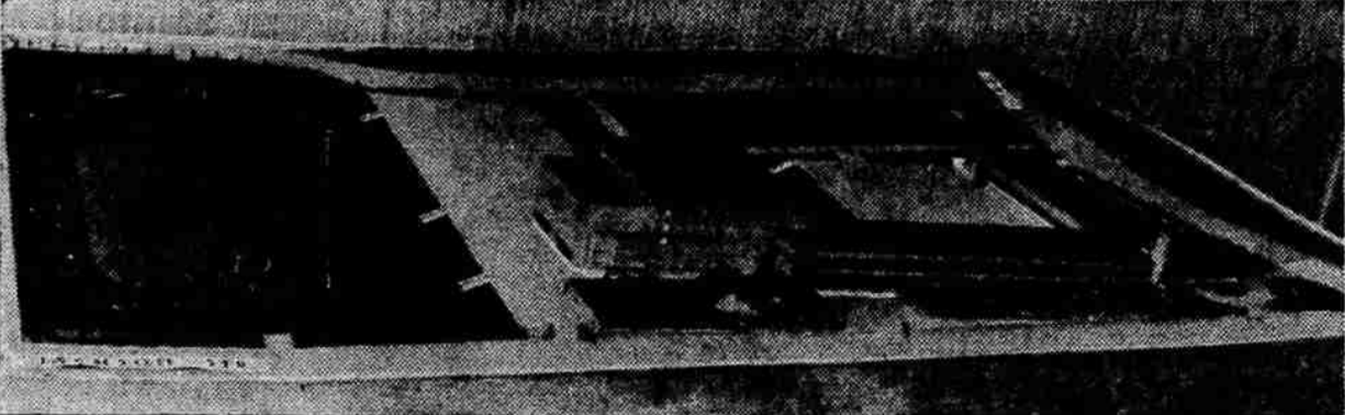
MODEL OF JUNIOR HIGH — Shown above is a model of the new junior high school building, being constructed in east Medford, as it will look when completed. August 1 has been set as the completion date. Architects for the new building are Keeney and Edson, Medford.