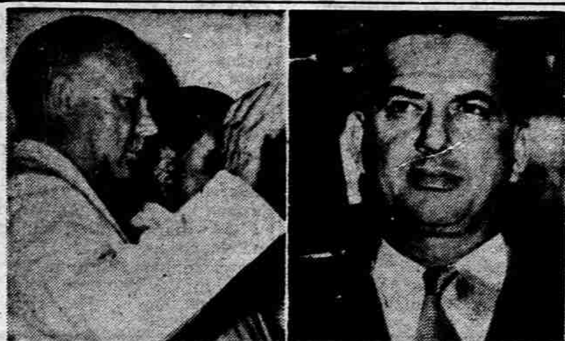
OUSTED FROM OFFICE of president of Panama after only 12 days on job, Jose Ramon Guizado (left) is under "protective" custody at home and First Vice-President Ricardo Arias Espinosa (right) is named president. Guizado is held as accomplice in assassination of ex-President Jose Antonio Remon.