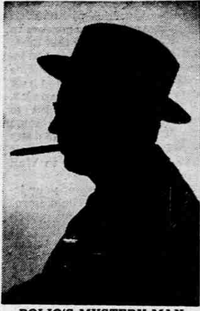
POLIO'S MYSTERY MAN Who Is He?

A pair of scientific binoculars from Hubbard Brothers Hardware has been added to the elec-