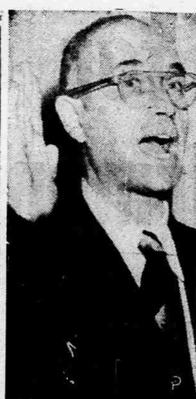
GIVING Democrats control of Senate, Oregon's Richard M. Neuberger takes oath of office in Washington.

The importance of purchasing parakeets and other similar birds only from recognized dealers was stressed again today by officials of the Jackson county health department. "There is no cause to worry about contacting psittacosis if you purchase a bird from a recognized dealer," they said. They pointed out that these dealers, and local growers, "have been abiding very well by the requirements." A report from the Oregon State Board of Health for the week ending Dec. 25, 1954, showed five cases of psittacosis in the United States, with one of them in the state of Washington. The Washington case was associated with a parakeet supplied by a man previously arrested in Oregon for illegal importation of parakeets, the report said. Local health authorities particularly warned against purchasing birds from transient door-to-door dealers.