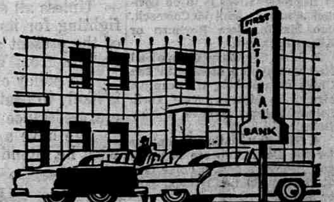
Free Parking while you bank at First National in the big new parking lot.