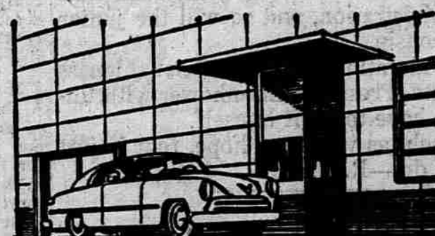
Now ... for the first time in Medford Two Drive-In Banking Windows!